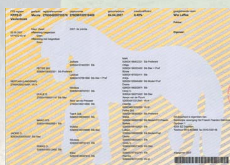
KFPS certificate D-book.