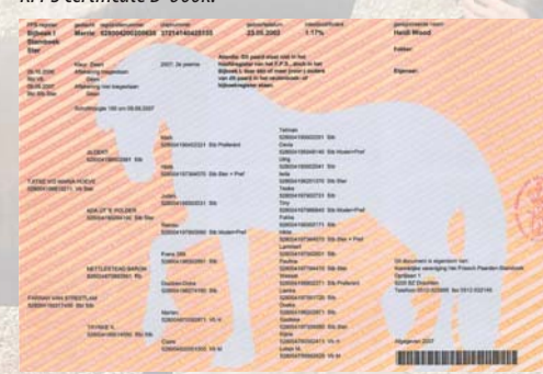
KFPS certificate B-book.