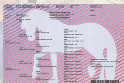
KFPS certificate B-book II